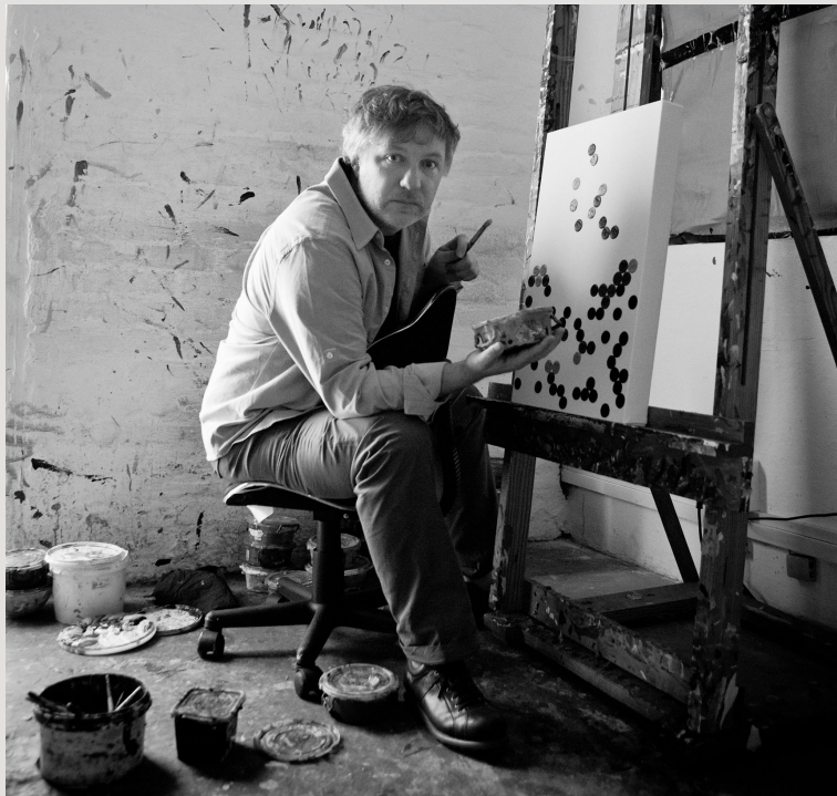
Gavin Rain (South African, born 1971)