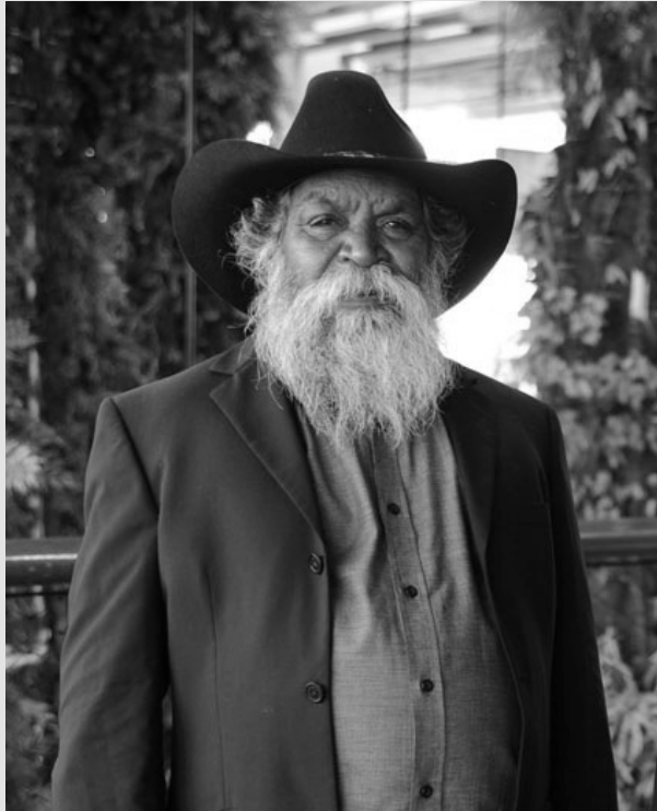
Warlimpirrnga Tjapaltjarri (Indigenous Australian, born 1958)