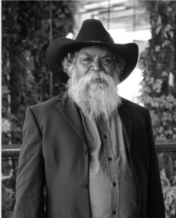
Warlimpirrnga Tjapaltjarri (Indigenous Australian (Pintupi), born 1958)